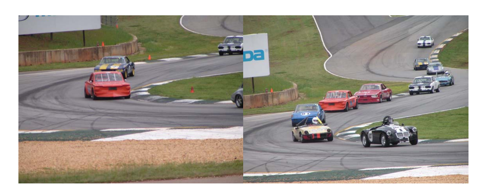
Watch for Warren's article in Classic Motorsports/Grassroots Motorsports Magazine